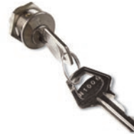
CM-B lock with two metal keys compatible with SELE