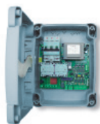
A500 Spare control unit. Pc/pack 1 £ 317.40