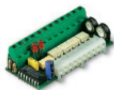
PIU Expansion card for control unit. Pc/pack 1 £ 32.10